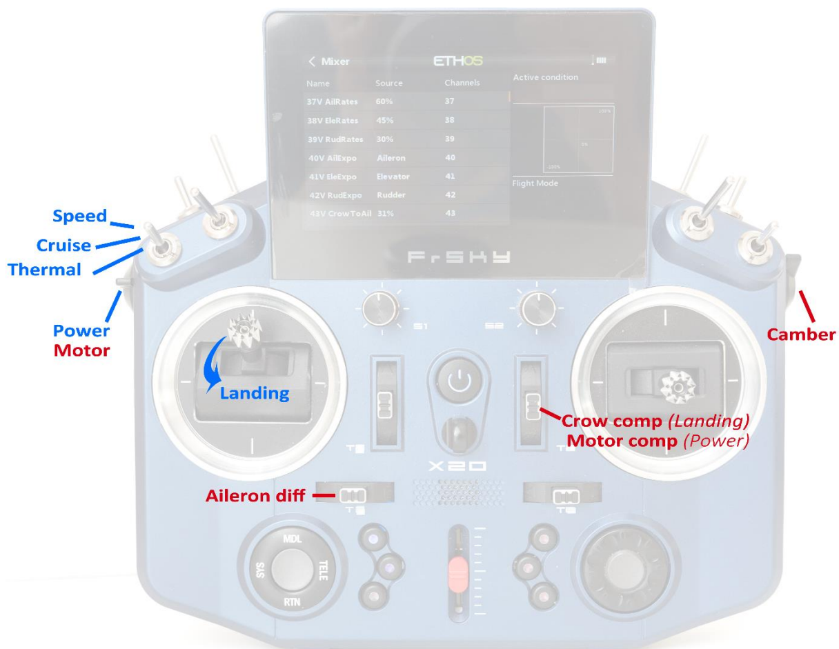
E-Soar Max control layout (Mode 2 shown)